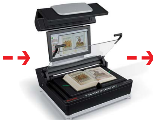
Scanning the book with a 2D scanner