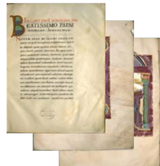
The ZED 10 3D-Explorer uses the 2D data to make ...