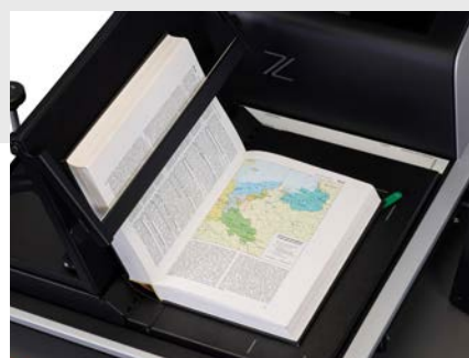
OS 15000 Comfort with book holder