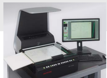
OS 15000 Advanced Plus: Scanning of large formats