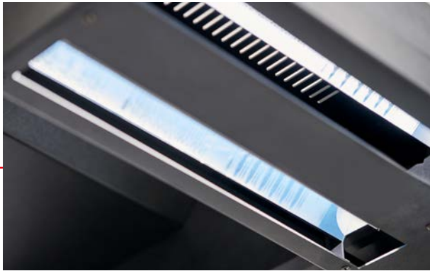
LED lighting system for reflection-free and shadow-free results