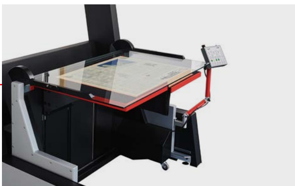
Wide range of interchangeable imaging systems