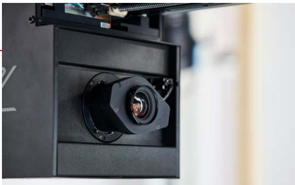
Camera system with a CMOS-based line sensor.