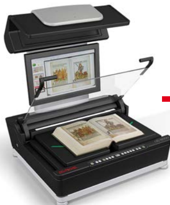
Scanning the book with a 2D scanner