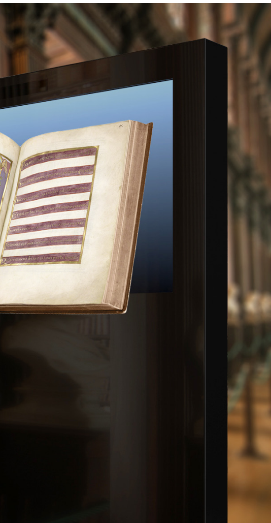
Users can view the book and control the application with gestures.