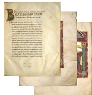
The ZED 10 3D-Explorer uses the 2D data to make ...