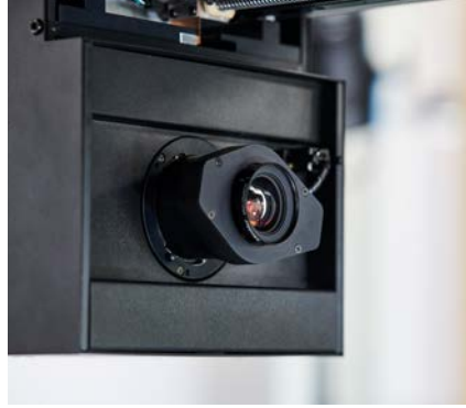
Camera system based on a CMOS sensor