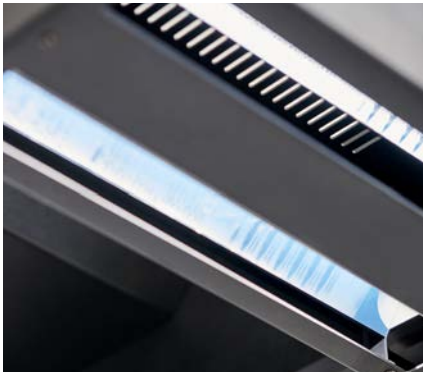
LED lighting system for reflection-free and shadow-free results