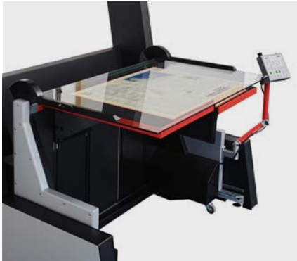
Wide range of interchangeable imaging systems