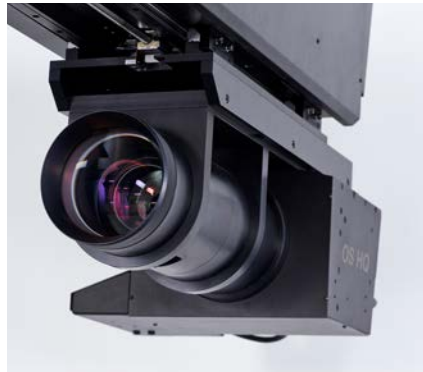
CMOS GigaPixel Camera system with optical zoom