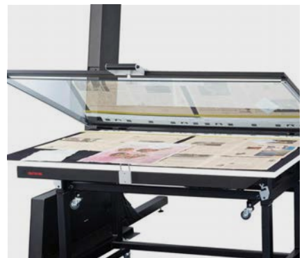
Toplight Table AT 0 with opened glass plate