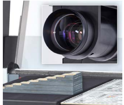
High depth of focus – mechanically adjustable shutter