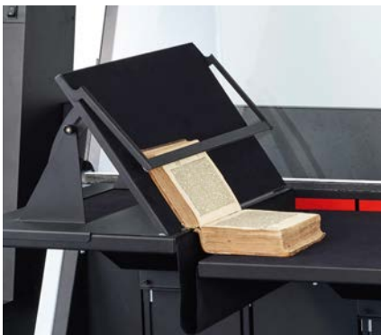
Bookholder on Copyboard OT 180 H 35 XL