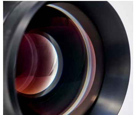
Perfect interplay between high-quality technical components