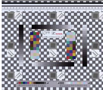
Fulfills ISO 19264-1 Level A, Metamorfoze Full and FADGI 4 Star