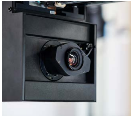
Camera system based on a CMOS sensor