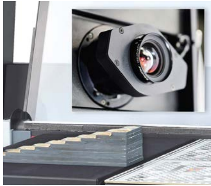
High depth of focus - electronically adjustable aperture