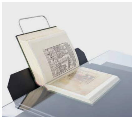
Various book holders optionally available