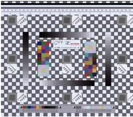
Fulfills ISO 19264-1 Level A, Metamorfoze Full and FADGI 4 Star